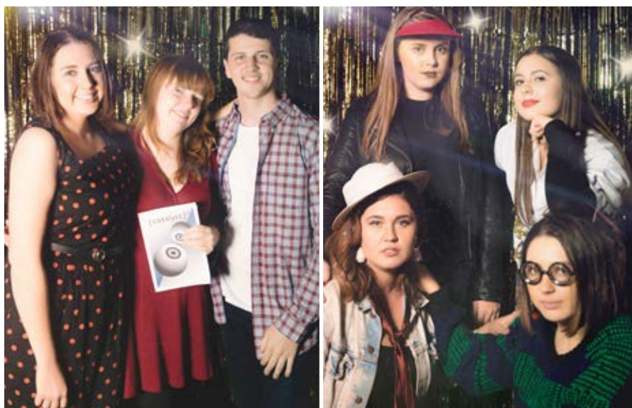
Catalyst Launch Party

This year we produced five issues of the magazine. Each edition had a theme picked by the editors, and then engaged with our editorial committee each month (made up of RMIT students across different schools) to work out what sort of content they would like to see in the magazine. The magazines featured written and visual