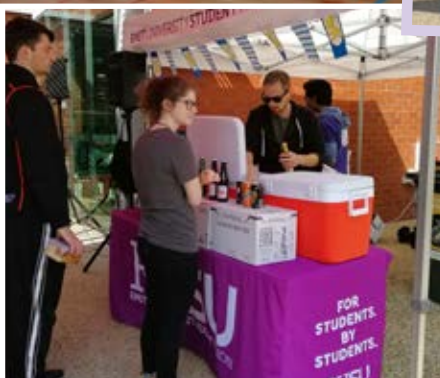
The Bundy Games 2017