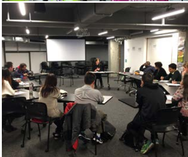
Above: Trash Puppet Workshop, Postgrad Masterclass Below: Student Welfare on Wheels trolley