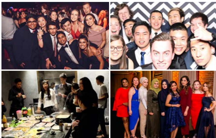
Clockwise from top left: BSA Ball, Geospatial Ball, RAPS Ball, Thai Association Hot Pot