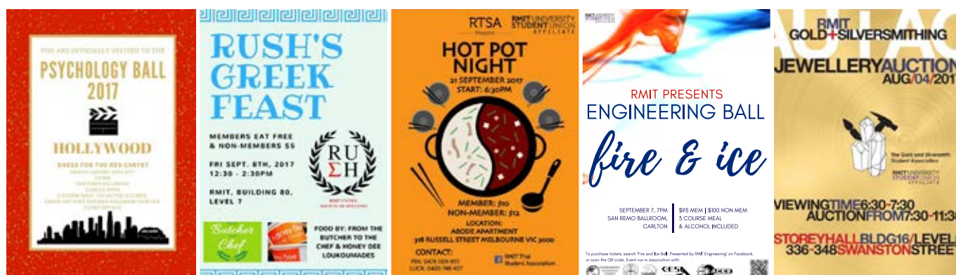
Clubs event posters