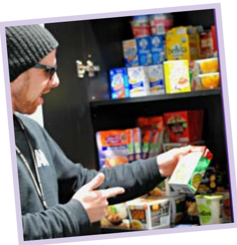
Above: Compass Cupboard, Right: RUOK Day across all campuses

Compass has delivered 5- 8 week wellness programs of events at City, Bundoora and Brunswick (see campus specific sections of the report). Free sessions have included flower crown making, hula hoop lessons, self defence, journal writing and lots more.