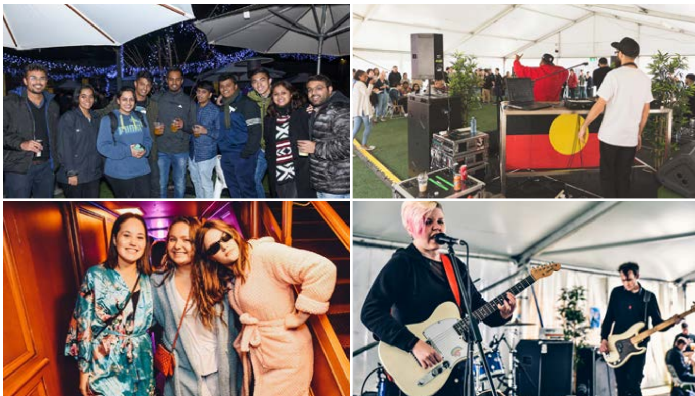
Clockwise from top left: Winter Wonderland, Indigenous Chill 'n' Grill, Super Chill 'n' Grill, Boat Party